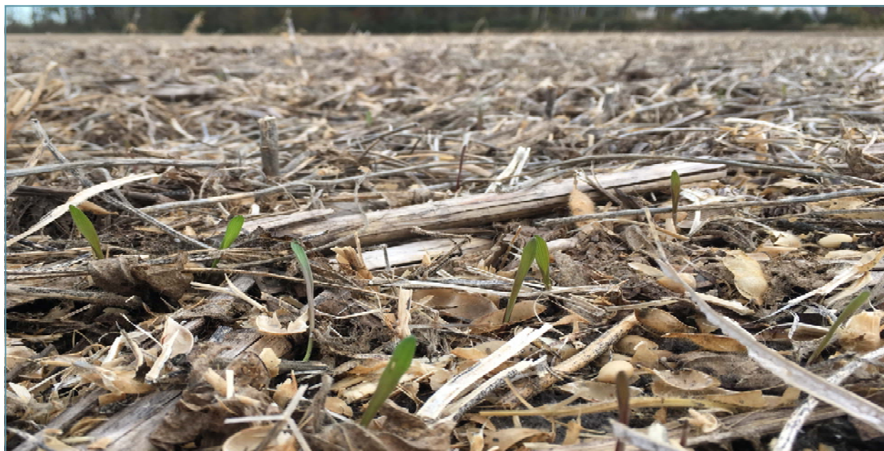
2 weeks after seeding, winter cereal rye was about 2 inches tall.