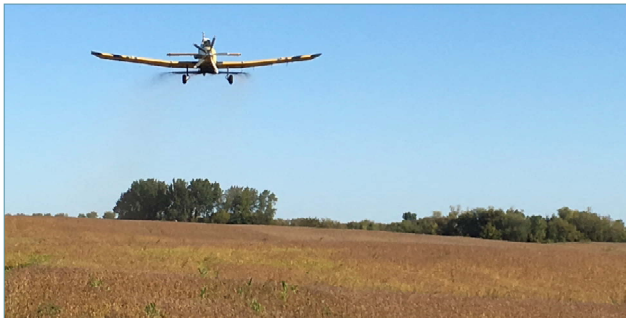
Cover crops were aerial seeded throughout the field.