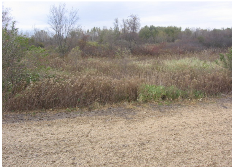
Filter strip adjacent to wetland