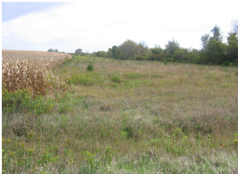
Filter strip adjacent to Chub Creek.