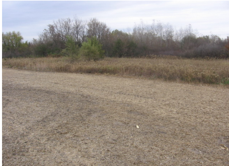
Filter strip adjacent wetland.